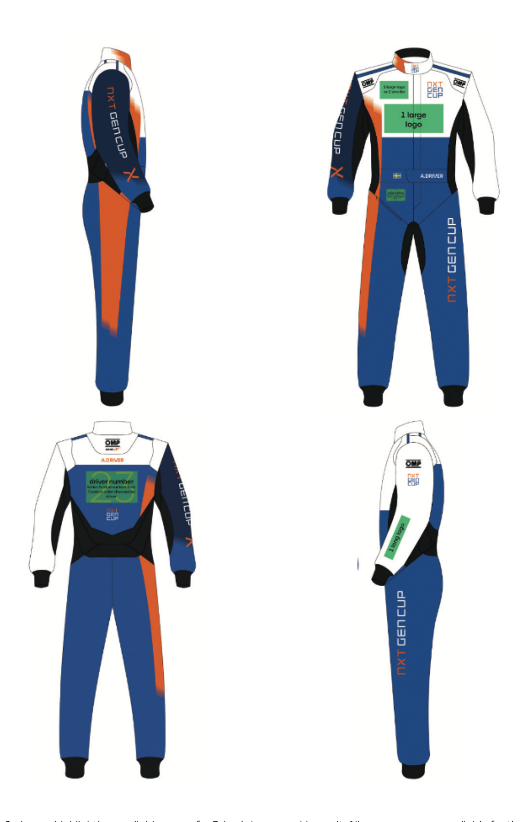
Figure 2 - Image highlighting available space for Driver's logos on driver suit. All green areas are available for the Driver to use according to the instructions in the image.